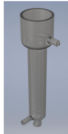
16 mm Reaction Cell P/N A46001100

The 16 mm Reaction Cell is a replacement/spare part for the colorimetric analyzers and is made of glass. The cell is positioned inside the thermostatic block and can be easily removed to allow for manual cleaning of the glass cell. Once the sample liquid is ready for analysis, the colorimetric analyzer shines the light source. A special version of the cell is available with an overflow (P/N A46001100-O) in order to have a separate wasteline for sample containing reagents. Specifically for the 16 mm Reaction Cell, an adapter is used in order for the cell to correctly fit into the analytical chamber.