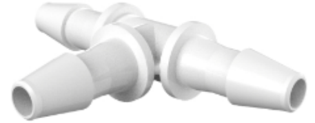
1/4" Barbed Equal T Fitting P/N A4600110D

At the vent, this item allows for all overflow fluid from the colorimetric cell to travel out of the drain. At the drain, this item allows for the overflow fluid and fluid from the entire colorimetric cell to empty out. It is very important that the drain line is at atmospheric pressure, and if not could lead to overpressure and damage to the analyzer.