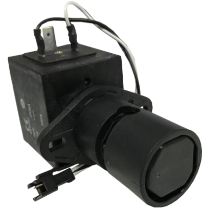
Pinch Drain Valve P/N A46001130

Ensuring that the outlet line is open and at atmospheric pressure allows for the Pinch Drain Valve to work properly.