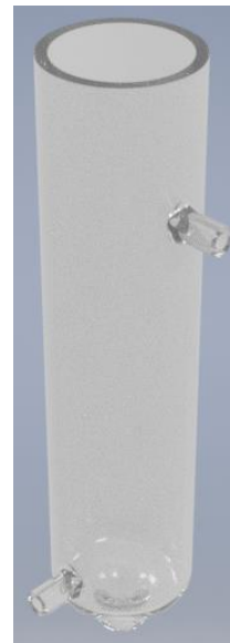
26 mm Reaction Cell P/N A46001150

The 26 mm Reaction Cell is a replacement/spare part for the colorimetric analyzers and is made of glass. The cell is positioned inside the thermostatic block and can be easily removed to allow for manual cleaning of the glass cell. Once the sample liquid is ready for analysis, the colorimetric analyzer shines the light source. A special version of the cell is available with an overflow (P/N A46001150-O) in order to have a separate wasteline for sample containing reagents.