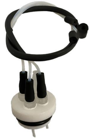
Teflon Cell Cap with Tubing and Threaded Fittings – 3 Reagents P/N A46001173

This item is used when the analyzer is being configured to have additional or less reagent pumps. The cell cap can be configured to have up to four reagent threaded fittings.