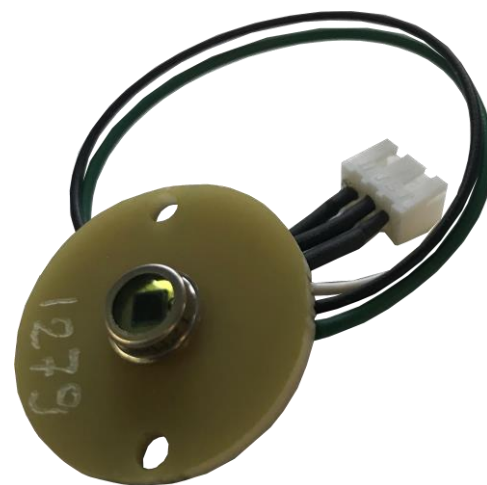
Preamplifier Photometer Board P/N A46001240

The Preamplifier Photometer Board is located on the opposite side of the LED light source. Photometer Board absorbs the light transmitted from the LED light source that goes through the sample and converts the absorbed light energy to an electrical current