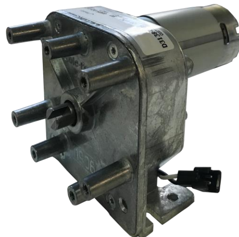
Pump Head Drive Motor P/N A46005113

The Pump Head Drive Motor moves the liquids through to the colorimetric cell where the analysis occurs.