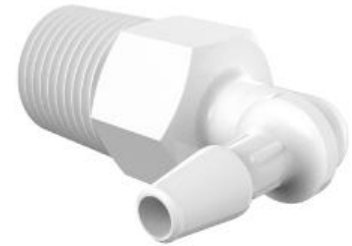
Thread Barb Elbow P/N A46005121

Up to three inlet liquids may be configured with each inlet requiring one Thread Barb Elbow. It is recommended to use the manufacturer's fittings to avoid maintenance problems.